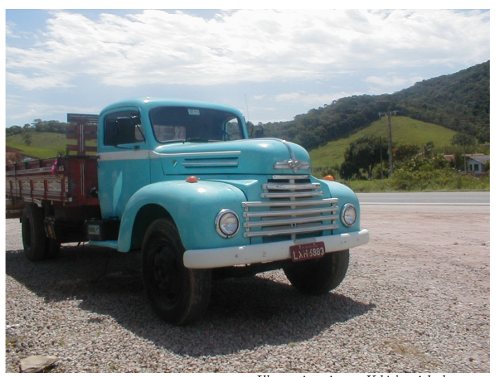
Illustrative picture. Vehicle with the same features and fabrication year