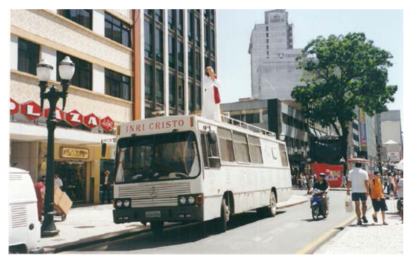
Motor-home Mercedes-Benz already concluded at Curitiba downtown