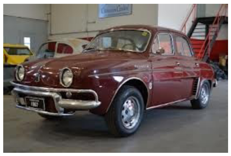
Illustrative picture. Vehicle with the same features and fabrication year