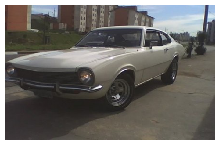
Illustrative picture. Vehicle with the same features and fabrication year