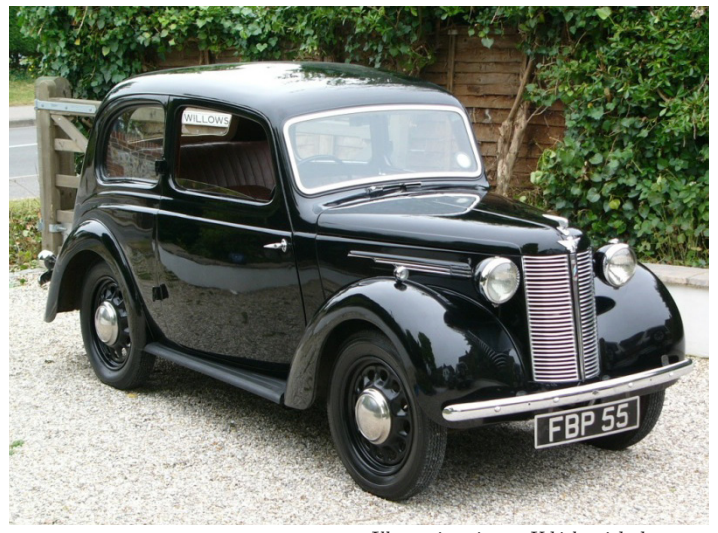
Illustrative picture. Vehicle with the same features and fabrication year

This car almost stopped when going up the hills. It had a weak motor, 25 HP. Arriving at Caxias do Sul, the Austin had a problem with the clutch, and there was only one garage able to fix an Austin. INRI obtained a clutch disk, but on arriving at Vacaria, in a steep climb, when trying to change the car into first gear, the clutch failed again... When braking, the brake oil tube burst... he looked back and a truck was coming! He had only one instant to decide between the truck and the bank... He chose the bank! The car had to be winched to the garage in Vacaria. It was despairing to know that the problem with the clutch disk continued and to purchase another one, it would be necessary to order it from Caxias do Sul.