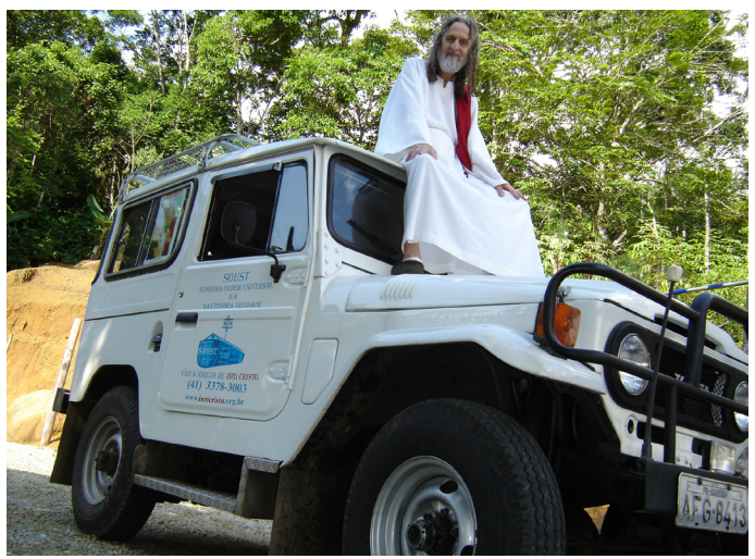
torious member to get the Toyota, without paying anything back.

One year later, SOUST purchased a smaller Toyota year 1972, which became well-known in the Brazilian media back in year 2003, when an industry of fines was provisionally installed in Curitiba's transit.