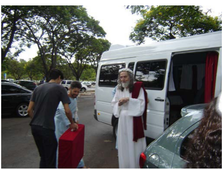
INRI CRISTO and disciples attending an invitation of UnB Journalism college

As the regularization of the motor-home was concluded, due to the need to speed up the trips in order to attend to the increase of appointments, long ranges and fuel expenses, it was negotiated with a retired state official, and from the resources a Sprinter van was purchased, through which INRI CRISTO and disciples currently move on the Brazilan roads, also attending media invitations.