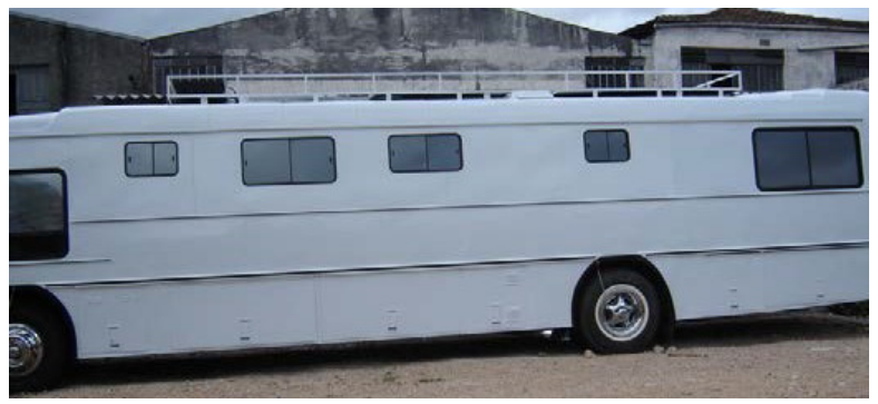
SOUST motor-home before receiving features

procedure of the mechanical reforms, since the vehicle year 1982 needed to pass through many stages in garage before running any trip.