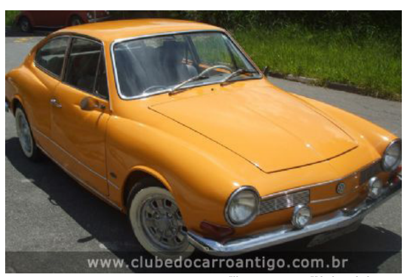
Illustrative picture. Vehicle with the same features and fabrication year