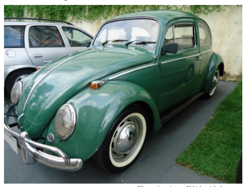
Illustrative picture. Vehicle with the same features and fabrication year

The manager made the installments much easier, thus effecting the sale. For the first time INRI enjoyed a brand new vehicle. It was a unique sensation! On June 2nd 1970 at 5:30 p.m., the bureaucratic part was done.