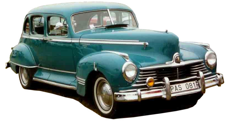
Illustrative picture. Vehicle with the same features and fabrication year

Some time later, following the inner voice that commands him, INRI returned to Florianopolis seeking a vehicle to accelerate his work as a peddler. Yet in 1967, in a garage, he purchased a blue Hudson year 1947. This car had an interesting system next to the clutch that allowed to use the foot to change the radio stations.