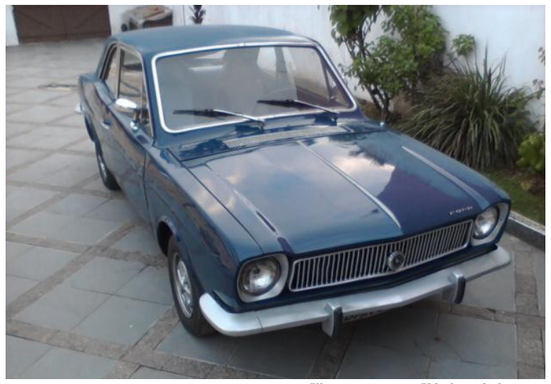
Illustrative picture. Vehicle with the same features and fabrication year

In 1973, INRI changed this vehicle by a house placed at Brasil para Cristo Street, in Curitiba. Soon after, still at the end of that year, he purchased a white Dodge Dart year 1973, black hood, which had only five kilometers registered on the clock. The previous owner died inside the car, for this reason the widow had no courage to use it.