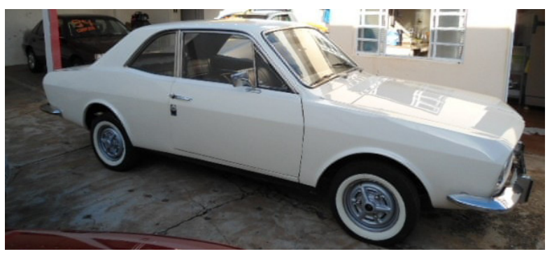
Illustrative picture. Vehicle with the same features and fabrication year